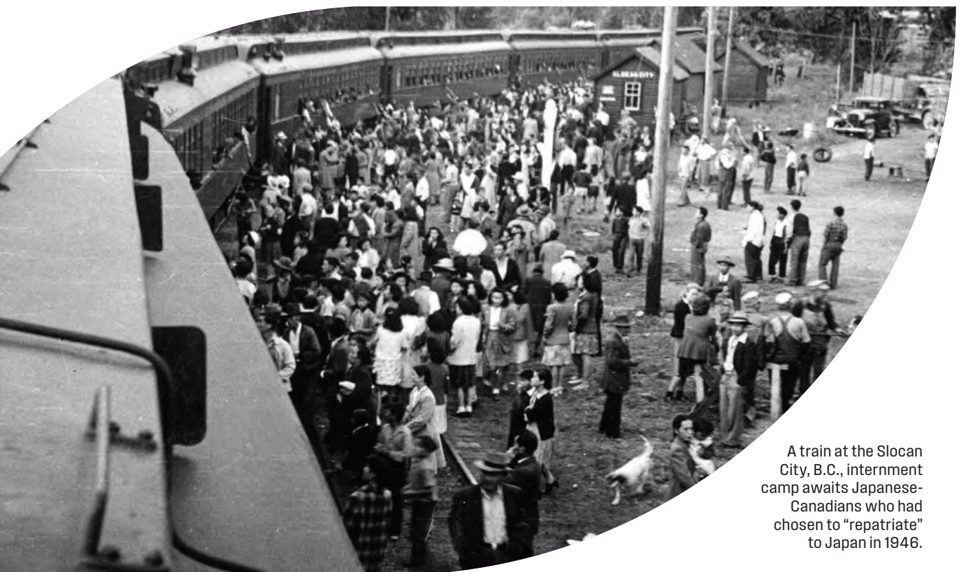
A train at the Slocan City, B.C., internment camp awaits Japanese-Canadians who had chosen to "repatriate" to Japan in 1946.

Between May 31 and Dec. 24, 1946, 3,964 interned Nikkei were exiled to Japan on five sailings. Of those on board, 1,943 were aging Issei (first-generation Japanese), 1,308 were Nisei (second-generation Japanese born in Canada) under 16 years of age, and 2,617 (66 per cent) were Commonwealth citizens by birth or naturalization, including 159 former inmates of the Petawawa and/or Angler prisoner-of-war camps in Ontario, seven WW I veterans, and 17 patients